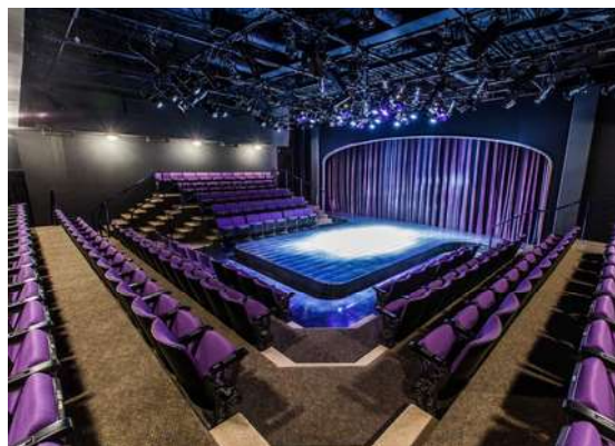
Purple Rose Theatre