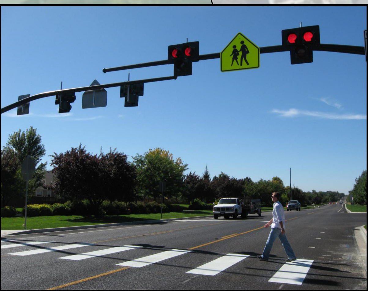
BEACON PEDESTRIAN CROSSING