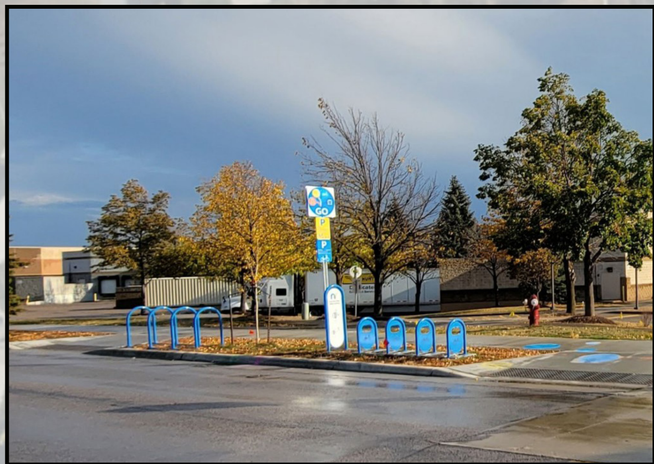
*MOBILITY HUB EXAMPLE