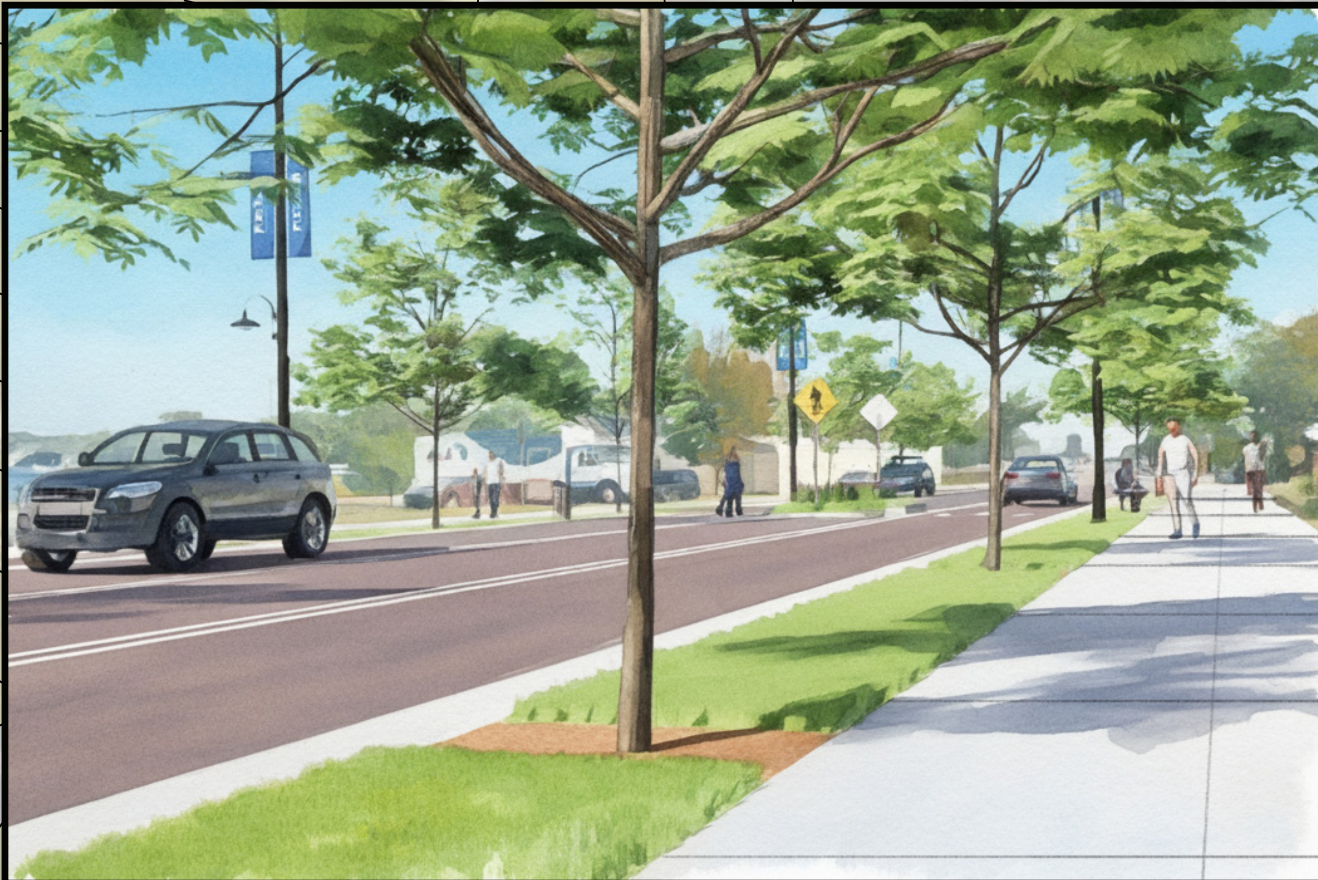
A WEST LAKE OVERLOOK CROSSING Preferred Alternative - Subject to Refinement during engineering and design