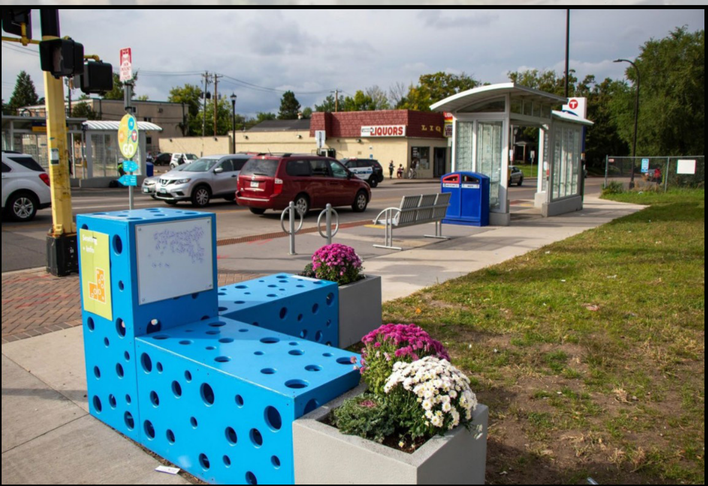
*From Minneapolis Green Zones Presentation 2.2.23 for graphic purposes only