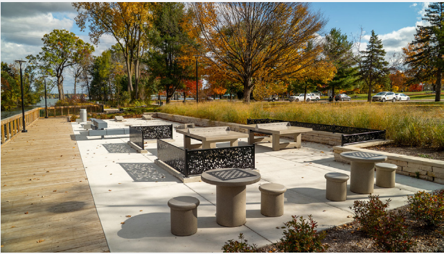
Game Pocket recreational area with tables and seating