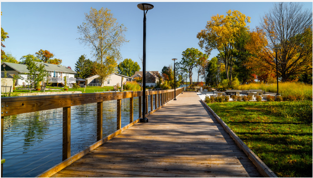
New 810-foot canal boardwalk with 24 new light poles at Lakeview Park.

Completed in October 2025, the renovation modernized one of Portage’s oldest parks with a $1.87 million investment, funded through a combination of American Rescue Plan Act funds,