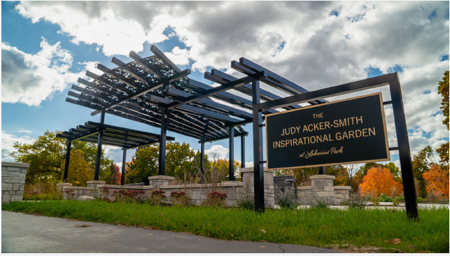
Judy Acker-Smith Inspirational Garden

Recreation. “We are proud to create a safe, inclusive, and environmentally conscious park that the community can enjoy for generations to come.” The city thanks the APWA Southwest Michigan Branch, project partners, contractors, donors, and the community for helping make this award-winning renovation possible.