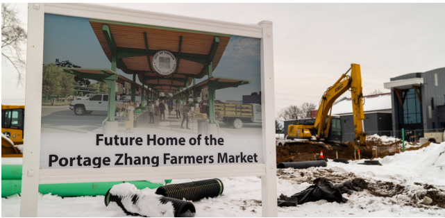
Work on the new Portage Zhang Farmers Market in the heart of the City Centre is underway and will continue through the winter.