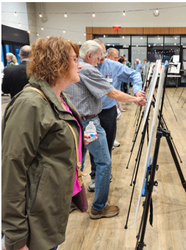
Members of the public review the Portage Road 360 preliminary design recommendations at Portage Road 360 Open House #4.

At the event, the city’s planning team presented final community goals and vision boards summarizing feedback