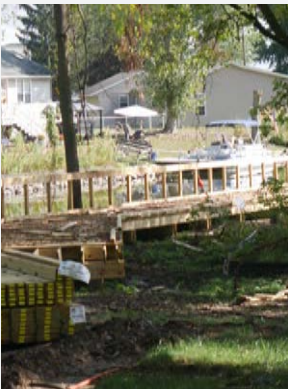
New boardwalk being constructed at Lakeview Park

of Lakeview Park’s revitalization. This phase is set to be finished by spring.