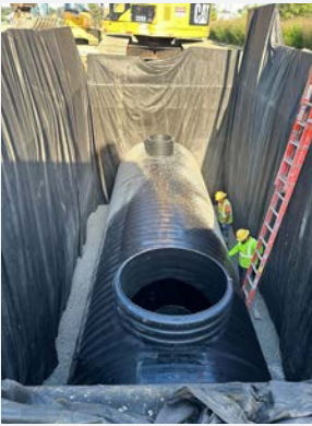
A new storm sewer relief system will alleviate flooding along the South Westnedge Commercial Corridor

Thank you for your patience and support as we work to build a better Portage. These improvements are vital investments in the future of our community, ensuring that Portage remains a safe, vibrant, and enjoyable place to live, work, and visit. We are excited for the positive impact these projects will bring, and we look forward to sharing more updates as we continue to make Portage A Natural Place to Move!