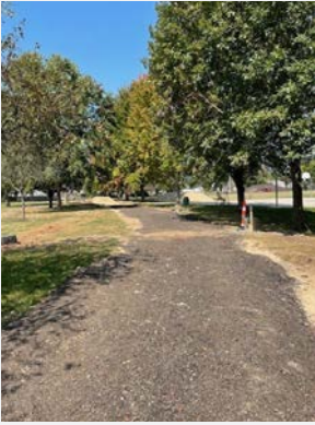
Trail construction at Lexington Green Park