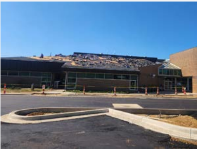
Portage City Hall parking lot and roof improvements