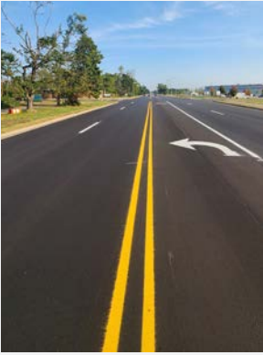
Portage Road is complete and open to traffic.