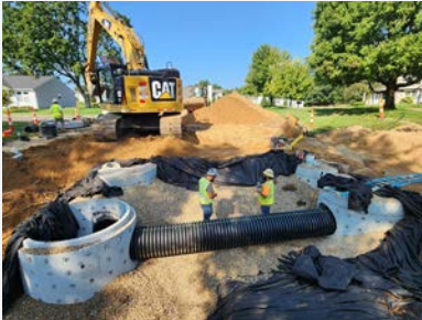
New storm sewers were installed as part of the Cooley Drive project

This reconstruction project includes gas main replacement, storm drainage improvements, and roadway realignment, with completion expected in October.