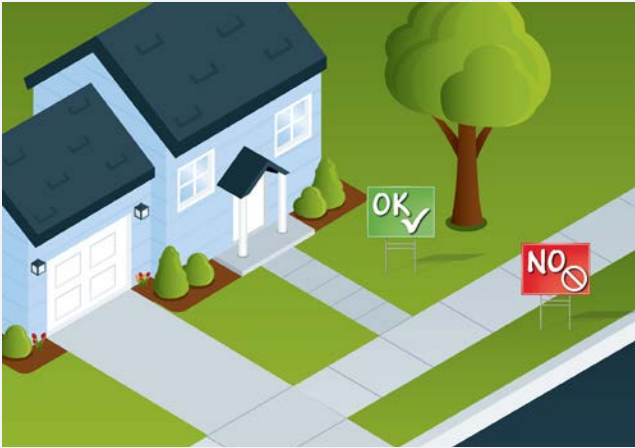
Temporary signs in residential districts cannot be placed in the right of way and cannot exceed six square feet. During an election period, signs can total up to 40 square feet, are allowed 45 days before an election and must be removed within five days following the election.

Signs placed outside of these guidelines may be removed by the city without notice and will be immediately disposed.