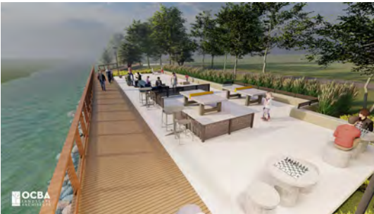
A rendering of a new boardwalk and game area at Lakeview Park.

As one of the city's oldest parks, boasting 1,200 feet of shoreline along Austin Lake, the renovation aims to upgrade and enhance the current features enjoyed by citizens, while introducing exciting new additions. Among these enhancements is a new game area equipped with outdoor ping pong, cornhole, and game tables, providing additional